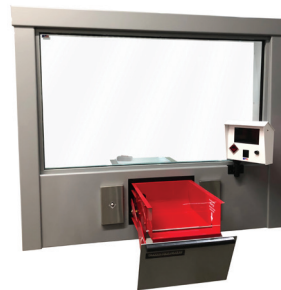
56X48 COMBO UNIT (12000993)