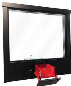
60X63 COMBO UNIT (12000989)