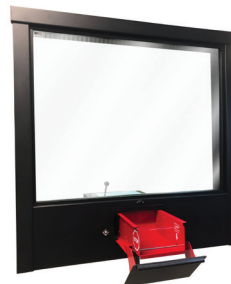
60X63 HURRICANE-RATED COMBO UNIT (12103991)

*Included HVHZ/Hurricane-rated glass and drawer arm upgrades.