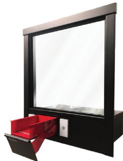
50X60 COMBO UNIT (12001017)