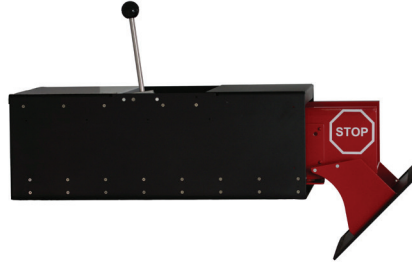
PREMIUM MANUAL TRANSACTION DRAWER